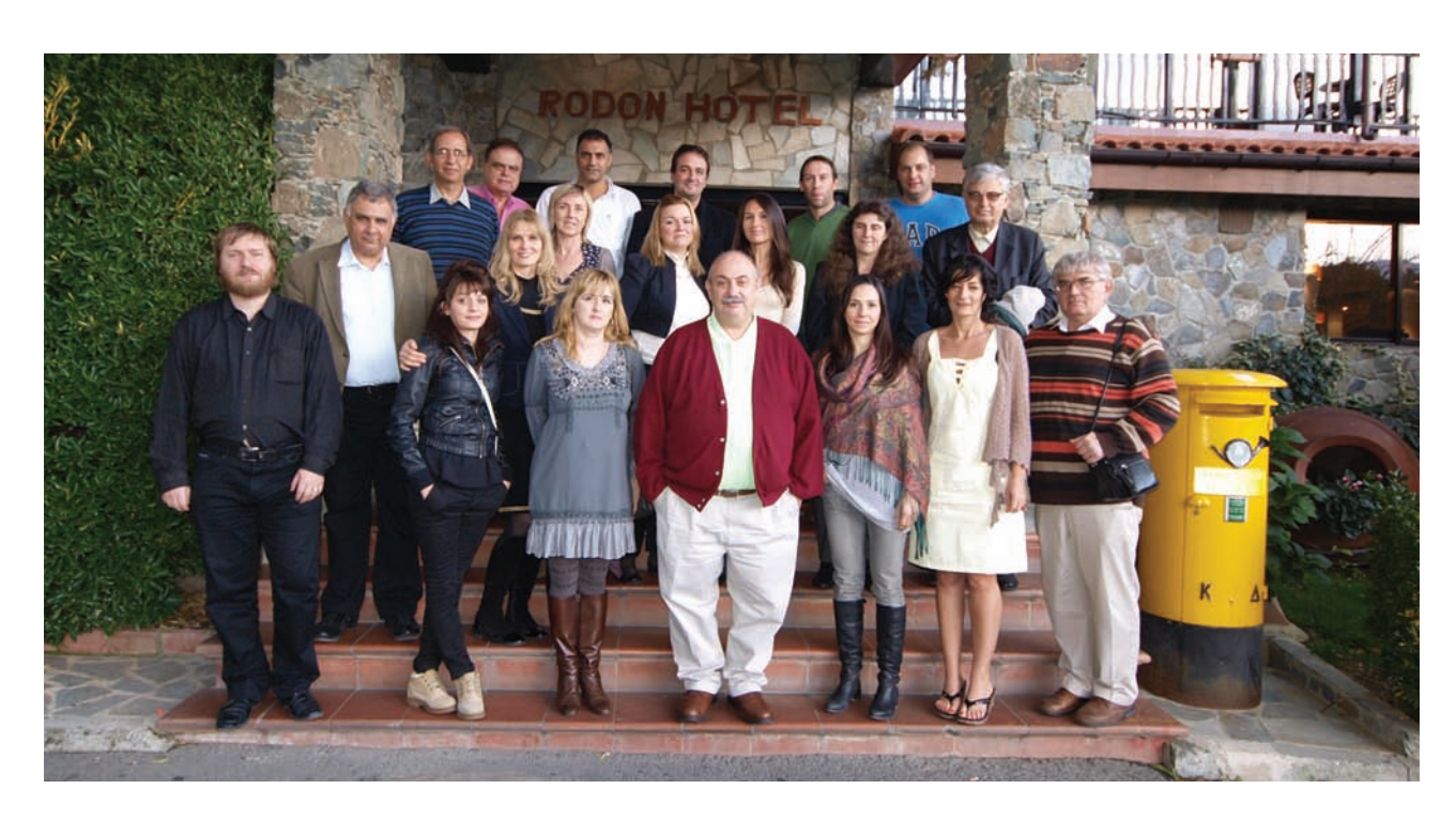
Comenius MP project running from November 2012 to October 2014

This project has been funded with the support of the European Commission.